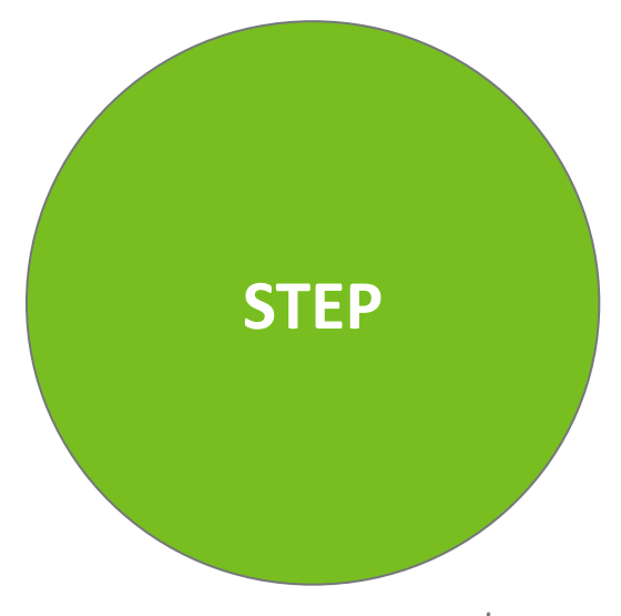
Maximum amount: $500

Events for graduating students as they transition to Young Professionals