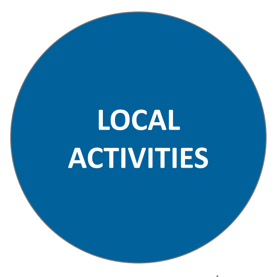
Maximum amount: $750

Events for graduating students as they transition to Young Professionals